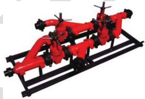
Drill Mud Manifold

Drilling mud manifold consists of mud valve, high pressure spherical union, high pressure core union, tee, high pressure hose, elbow, pressure gauge, and pup joint etc. PPGL supplies various mud manifold from 2”~4”, with working pressure 2,000PSI~10,000PSI as per API SPEC 16C /6A.