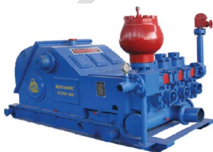
3NB Series Triplex Mud Pump

3NB series triplex mud pump is one popular piston pump used for local market with local design, now it's also greatly required by Russia, CIS customers.