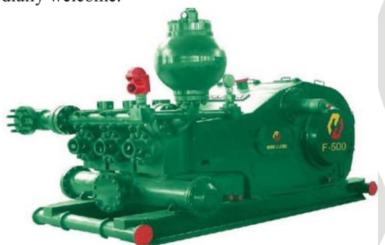
F Series Mud Pump

The made-in-China F Series mud pumps can meet the requirements of the same manufacturing technique and quality level as those of F series mud pumps of EMSCO, IDECO, GARDNER DENVER, OILWELL etc. Now, F series mud pumps (from F-500 to F-2200) have been produced in batches and sold to many abroad oilfields. Your order for F series mud pumps is cordially welcome.