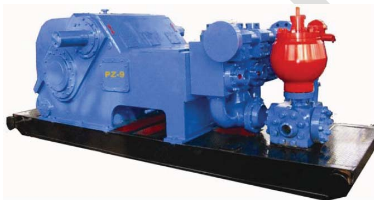
PZ-9 Triplex Mud Pump

Model P Z-9 mud pump is one horizontal Triplex Single Acting piston pump which is made as per American technology and API standards.